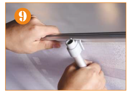
9 .Fix the pole on the top bar