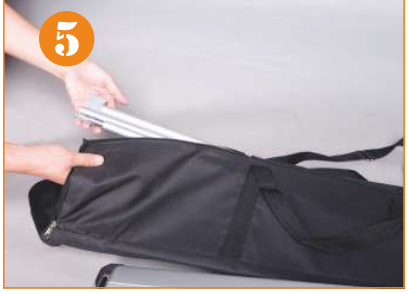
5 . Take out the pole from the bag