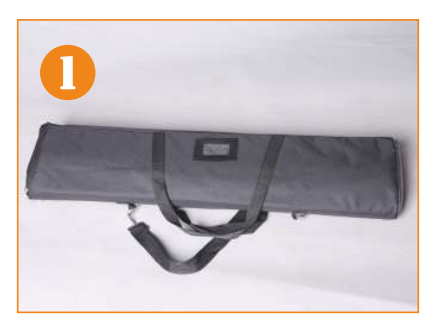
1.Bag with stands