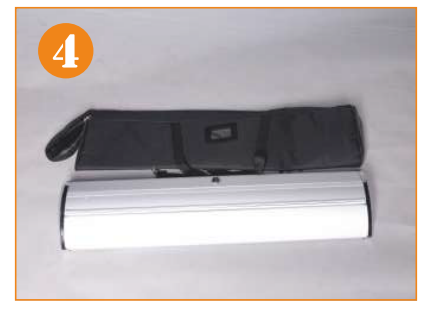
4. Put on the ground