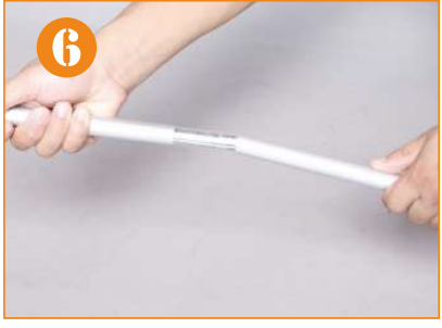
6.Fix the pole