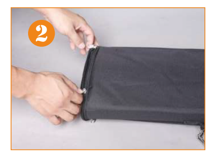
2.Open the bag like this